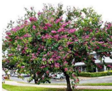
Hong Kong Orchid