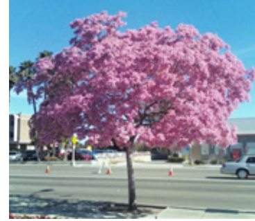
Pink Trumpet Tree