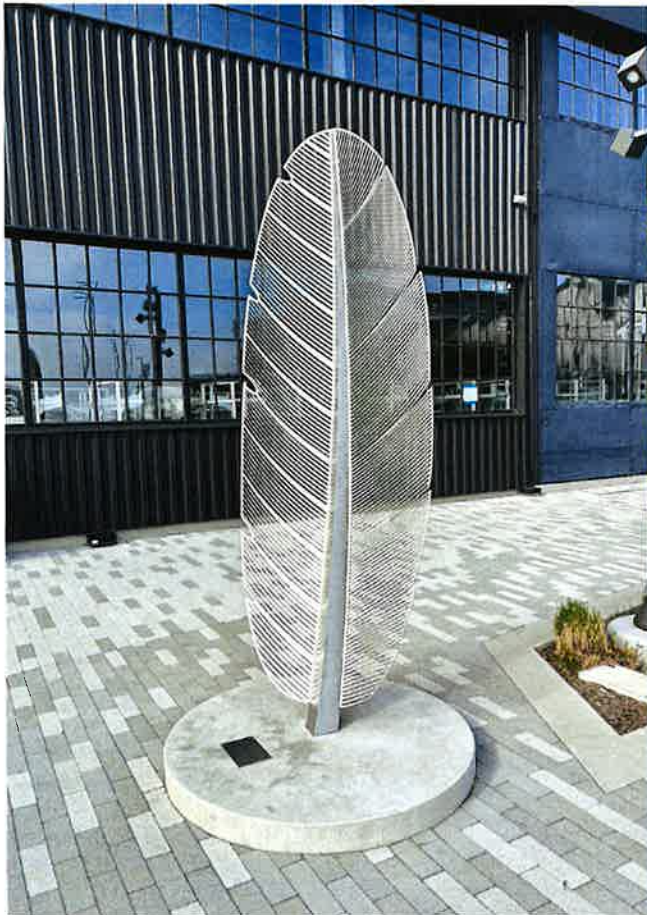
"PLUMAFOLIUM" by HYBYCOZO, 2022 Beyond Meat 888 N Douglas St.